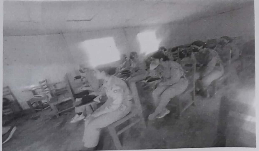
Weapon Training Class of SW Cadets of GDC Ganderbal held on 20 th March 2023