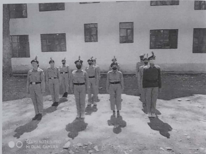
Drill Class SW Cadets of GDC Ganderbal held on 20 th March 2023