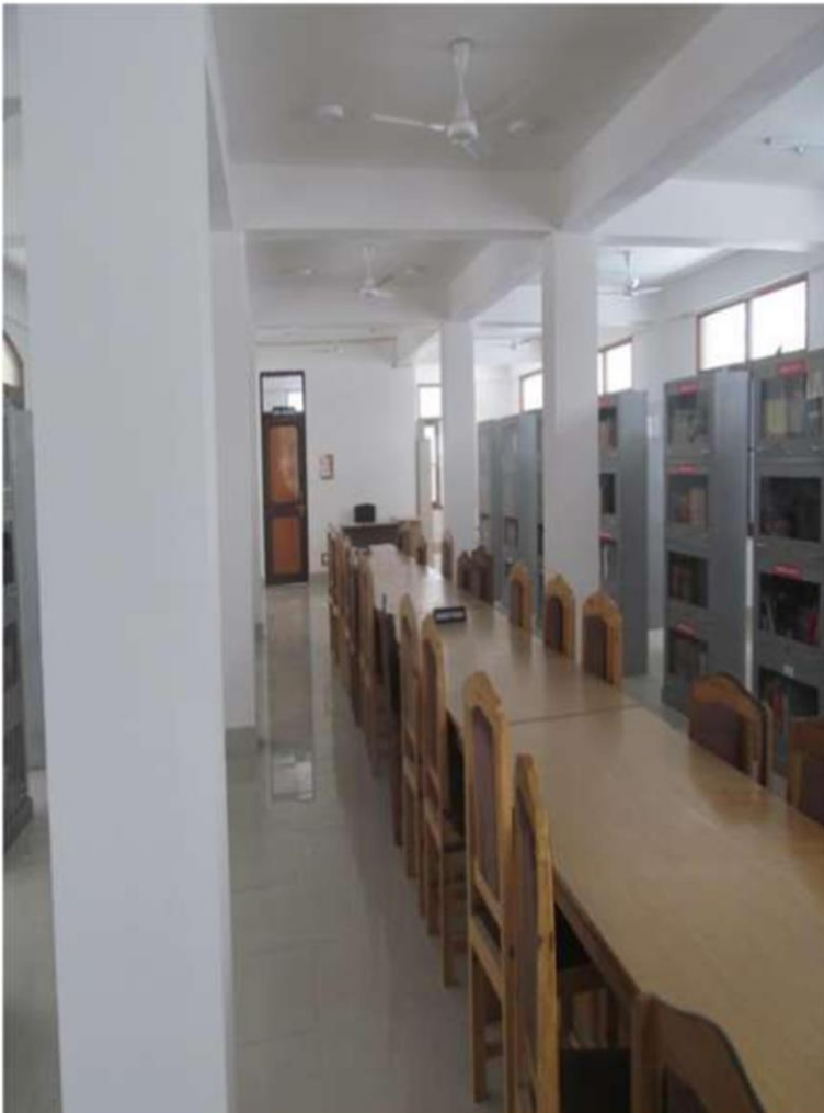
Reading Hall cum Reference Section