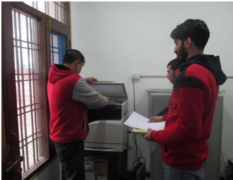
Xerox-facility at college Library