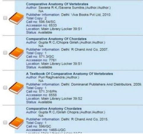
Screenshot of SOUL 2 WEBOPAC

Sort by: Select 1 To 4 records found out of 4 Records