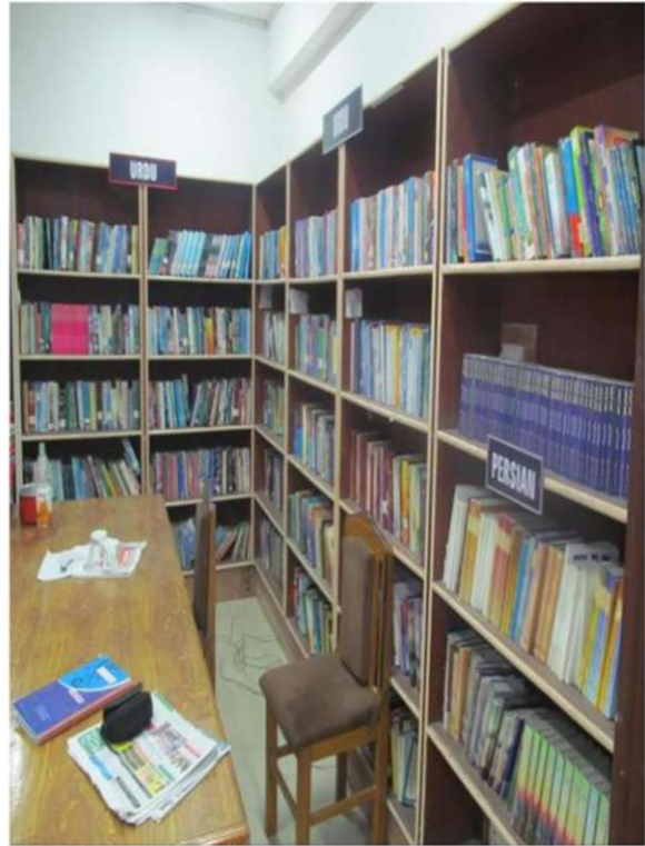
General Section of the Library