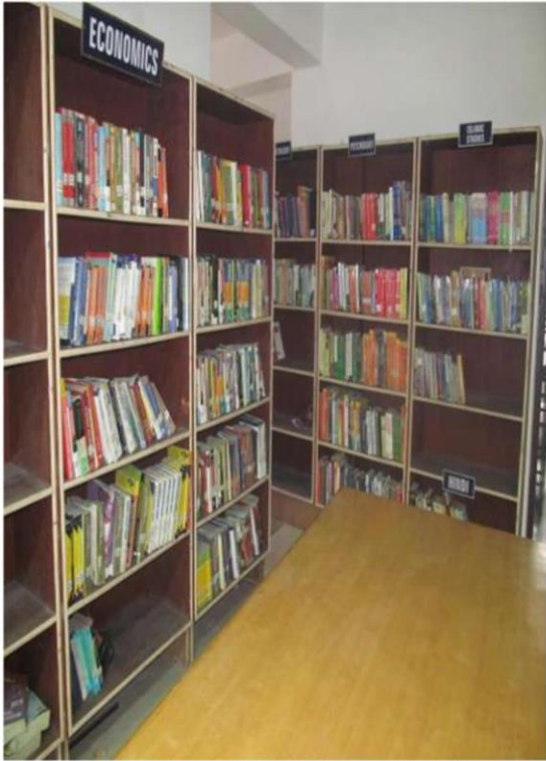
General Section of the Library