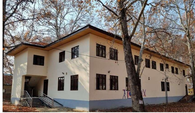
Gym cum Health Centre