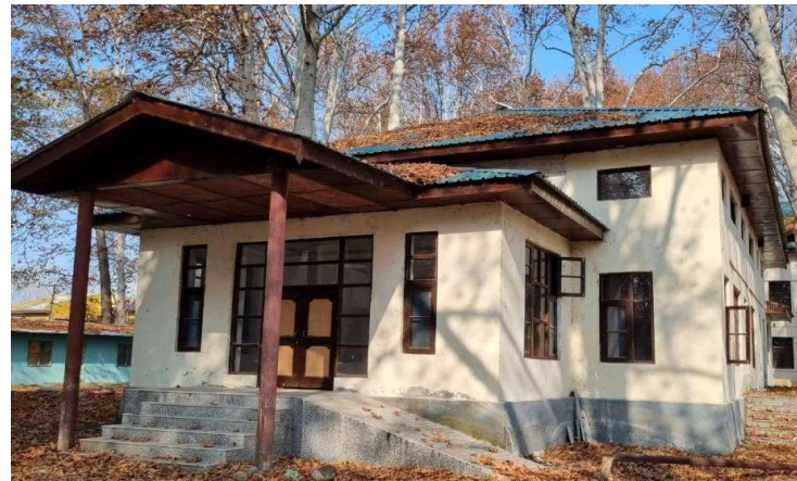
State of Art Auditorium