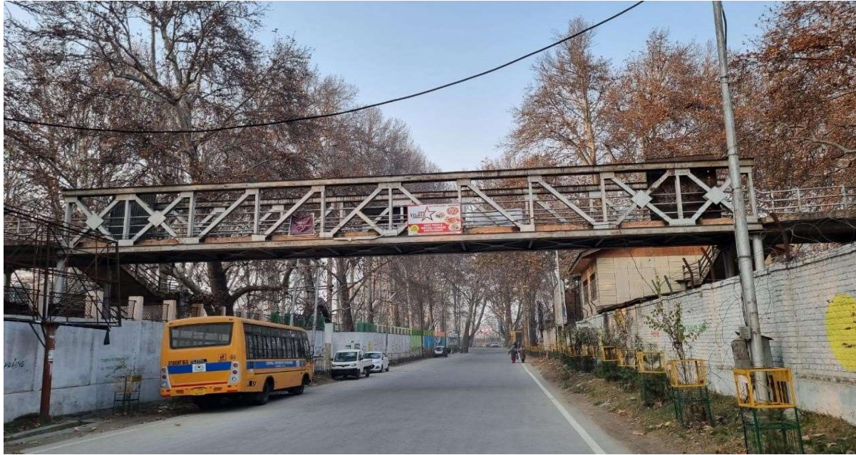
Boundary walls and over-bridge Connecting East and West Campus