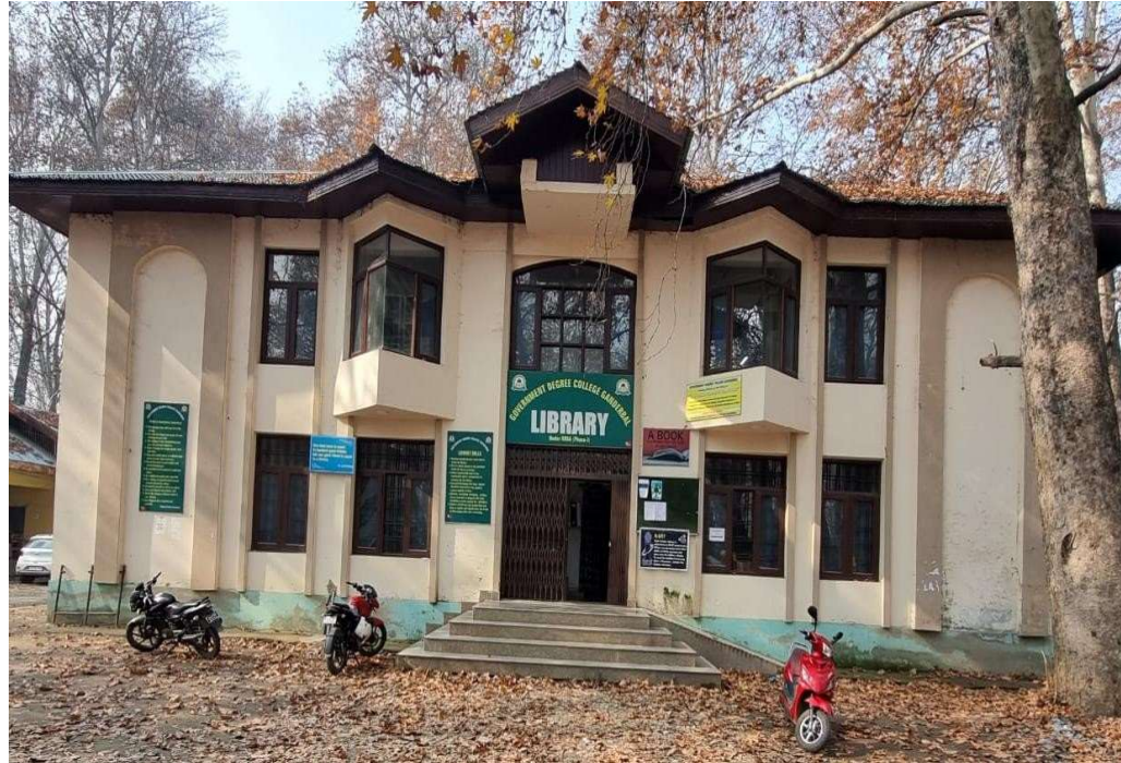
Library Block with fully automated library in the West campus